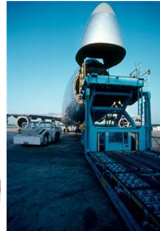
Air Navigation Service Providers